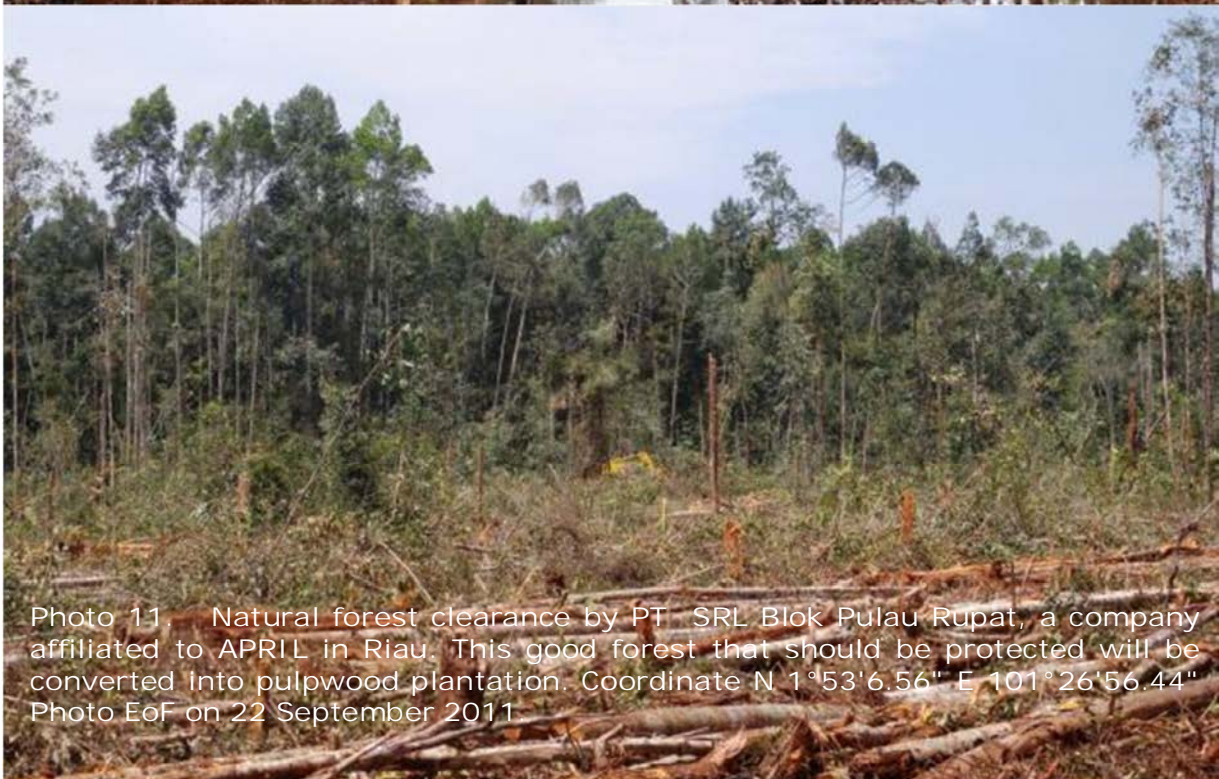
Photo 11. Natural forest clearance by PT SRL Blok Pulau Rupert, a company affiliated to APRIL in Riau. This good forest that should be protected will be converted into pulpwood plantation. Coordinate N 1°53'6.56" E 101°26'56.44" on 22 September 2011