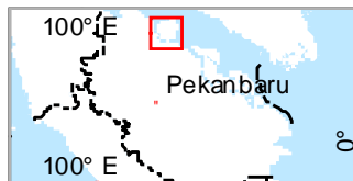
Map 1. PT Sumatera Riang Lestari concession in Pulau Rupert that overlaid by map based on Minister of Forestry Decree Number 323/Menhut-II/2011, dated 17 June 2011 concerning to Determining Indicative Map on Postponement for Granting New License for Forest Utilization, Forest Area Utilization and Conversion of Forest Area and Other Uses, so the concession sits inside the area banned by the Government to manage forest in the peatlands (see pink color).