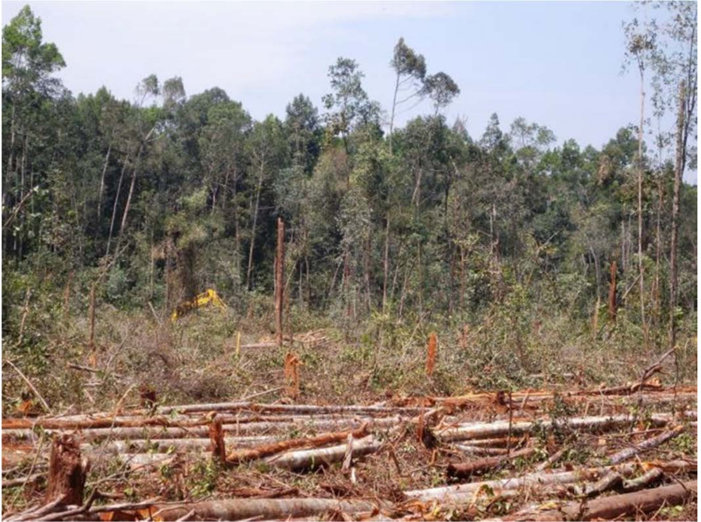
Photo 14. Natural forest clearance by PT SRL Blok Pulau Rupert, a company affiliated to APRIL in Riau. This good forest that should be protected will be converted into pulpwood plantation. Coordinates N 1°53'5.93" E 101°26'56.69". Photo by EoF on 22 September 2011