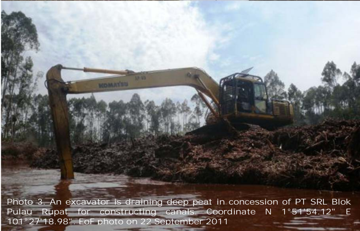
Photo 3. An excavator is draining deep peat in concession of PT SRL Blok Pulau Rupert for constructing canals. Coordinate N 1°51'54.12" E 101°27'18.98". EoF photo on 22 September 2011