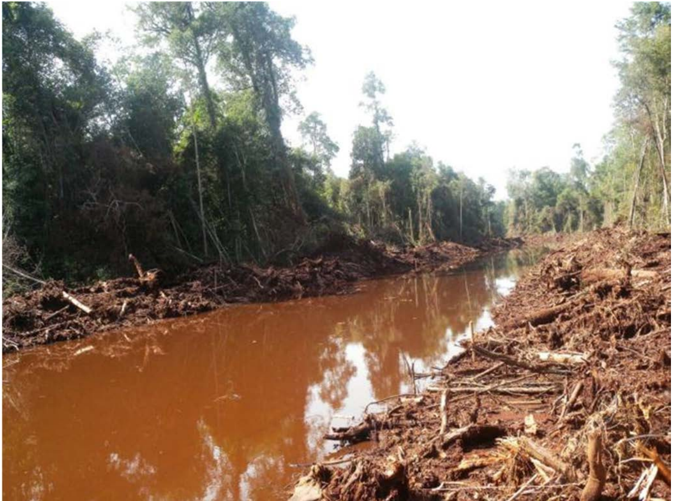
Photo 1. Peat canal drainage and forest clearance in Pulau Rumat, an island in east of Sumatra, by PT. Sumatera Riang Lestari, a company affiliated to APRIL in Riau. EoF photo on 22 September 2011 with coordinate N. 1°51'7.60"E. 101°27'7.54"