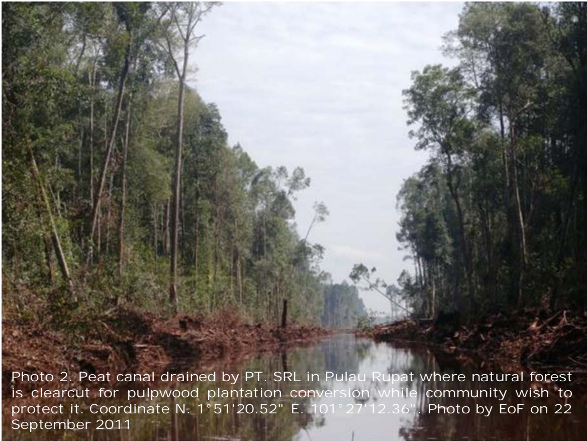
Photo 2. Peat canal drained by PT. SRL in Pulau Rupert where natural forest is clearcut for pulpwood plantation conversion while community wish to protect it. Coordinate N. 1°51'20.52" E. 101°27'12.36". Photo by EoF on 22 September 2011