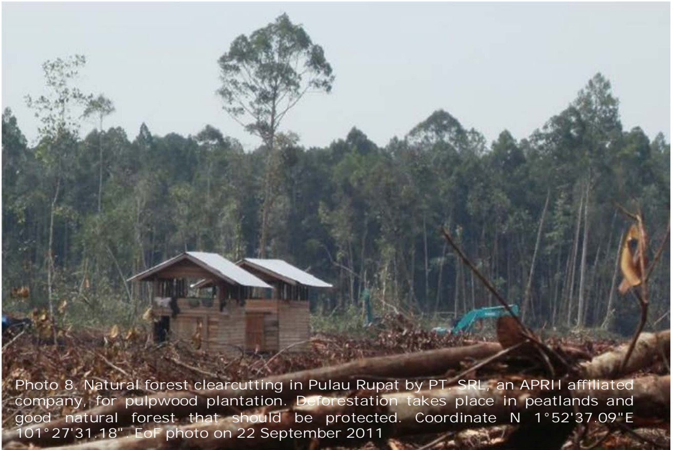
Photo 8. Natural forest clearcutting in Pulau Rupert by PT. SRL, an APRIL affiliated company, for pulpwood plantation. Deforestation takes place in peatlands and good natural forest that should be protected. Coordinate N 1°52'37.09"E 101°27'31.18". EoF photo on 22 September 2011