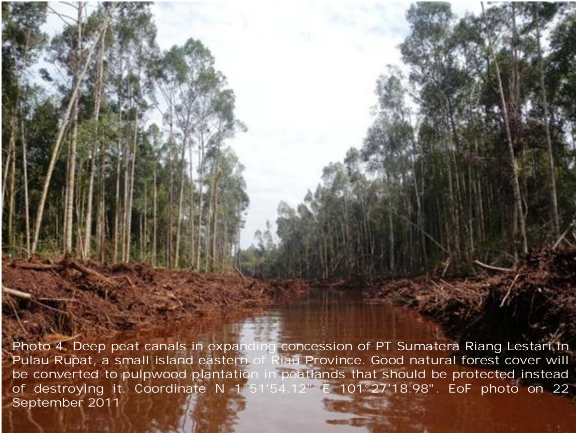
Photo 4. Deep peat canals in expanding concession of PT Sumatera Riang Lestari In Pulau Rupert, a small island eastern of Riau Province. Good natural forest cover will be converted to pulpwood plantation in peatlands that should be protected instead of destroying it. Coordinate N 1°51'54.12" E 101°27'18.98". EoF photo on 22 September 2011