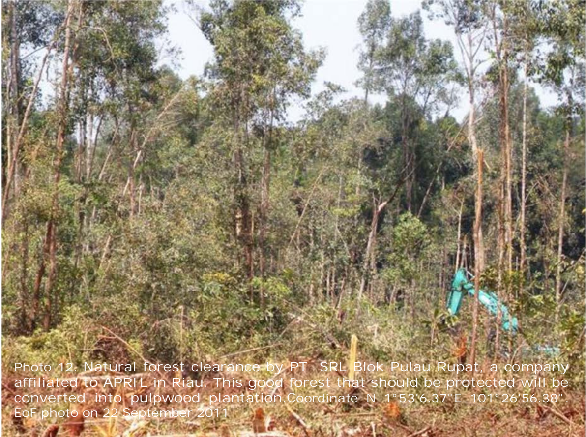
Photo 12. Natural forest clearance by PT SRL Blok Pulau Rupert, a company affiliated to APRIL in Riau. This good forest that should be protected will be converted into pulpwood plantation. Coordinate N 1°53'6.37"E 101°26'56.38". EoF photo on 22 September 2011