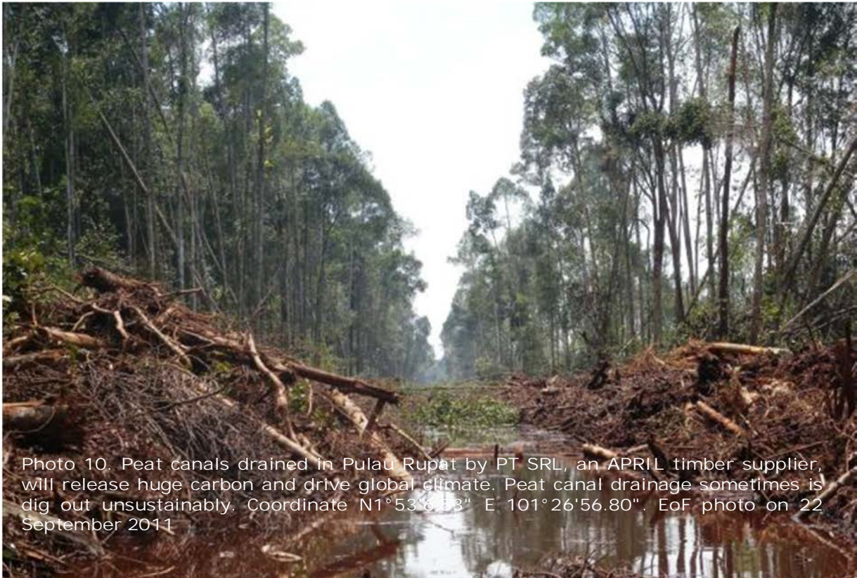
Photo 10. Peat canals drained in Pulau Rupert by PT SRL, an APRIL timber supplier, will release huge carbon and drive global climate. Peat canal drainage sometimes is dig out unsustainably. Coordinate N1°53'6.53" E 101°26'56.80". EoF photo on 22 September 2011