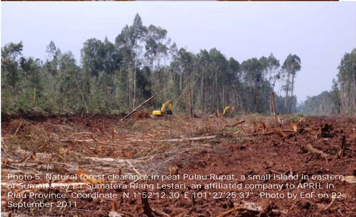
Photo 5. Natural forest clearance in peat Pulau Rupert, a small island in eastern of Sumatra, by PT Sumatera Riang Lestari, an affiliated company to APRIL in Riau Province. Coordinate N 1°52'12.30 E 101°27'25.37". on 22 September 2011