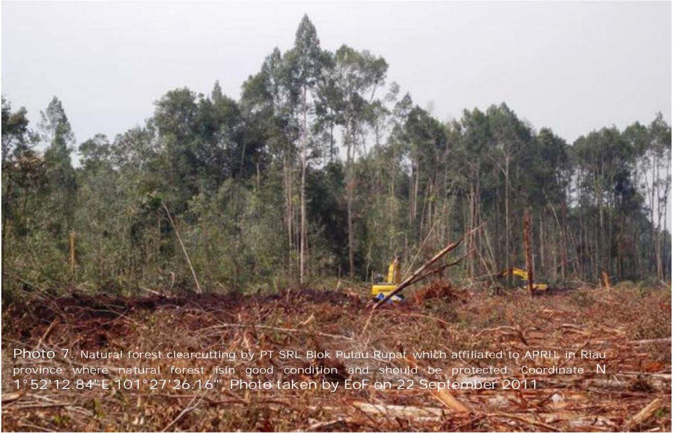
Photo 7. Natural forest clearcutting by PT SRL Blok Pulau Rupert which affiliated to APRIL in Riau province where natural forest is in good condition and should be protected. Coordinate N 1°52'12.84"E 101°27'26.16". Photo taken by EoF on 22 September 2011