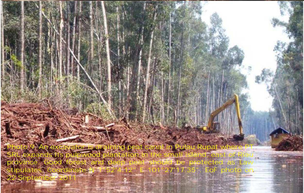
Photo 9. An excavator is draining peat canal in Pulau Rupert where PT SRL expands its pulpwood plantation in the small island, east of Riau province. Good forest and deep peat should be protected as Law stipulates. Coordinate N 1°52'4.12" E 101°27'17.35". EoF photo on 22 September 2011