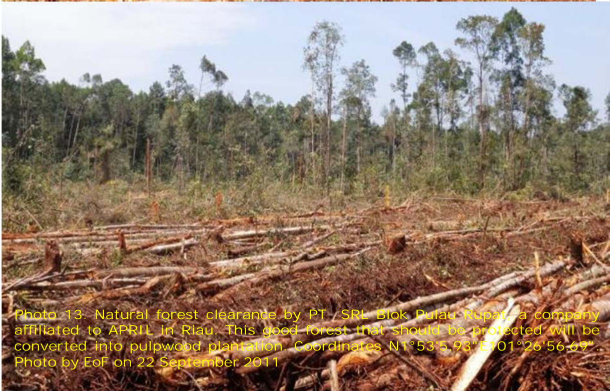
Photo 13. Natural forest clearance by PT SRL Blok Pulau Rupert, a company affiliated to APRIL in Riau. This good forest that should be protected will be converted into pulpwood plantation. Coordinates N1°53'5.93"E101°26'56.69". on 22 September 2011