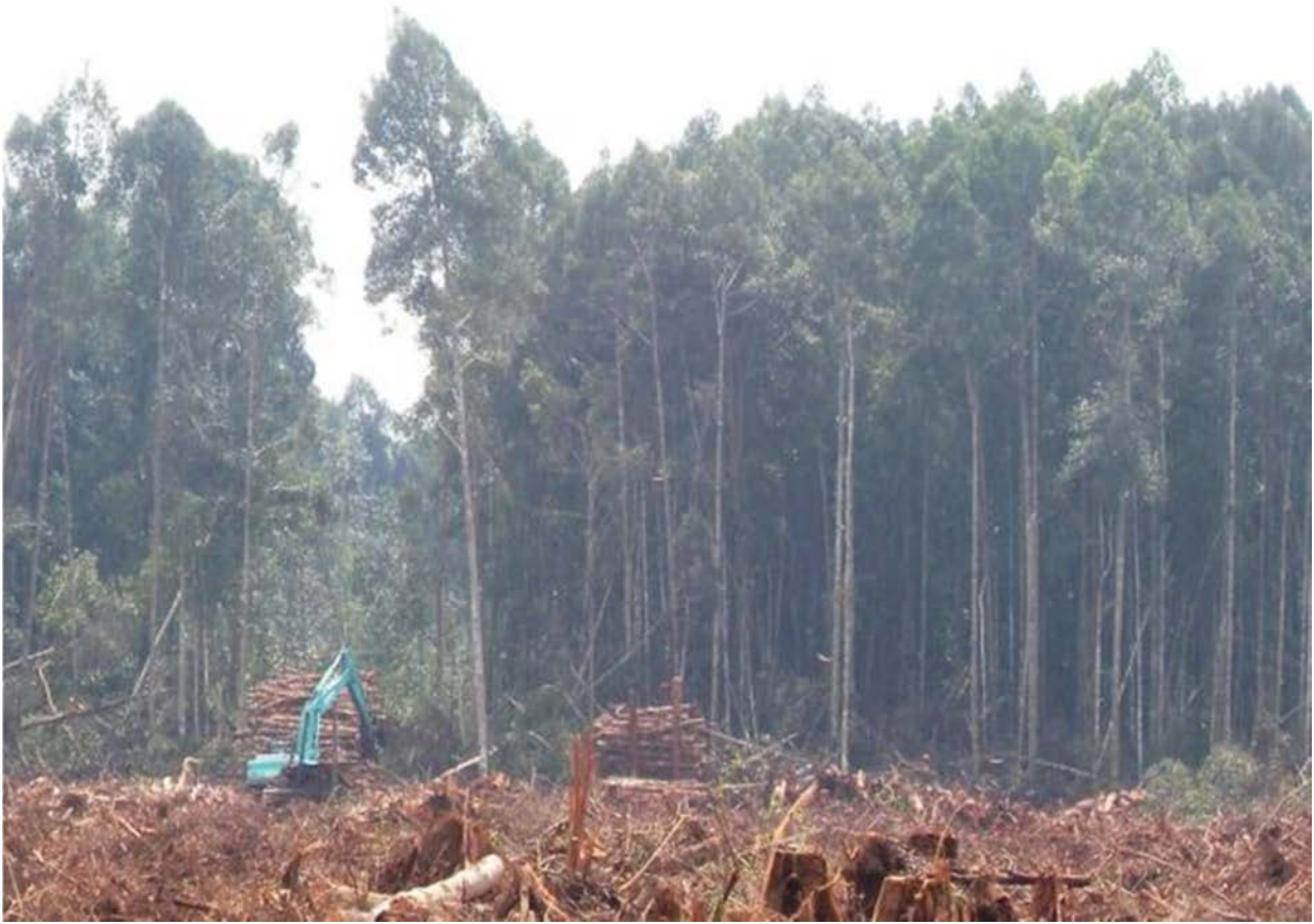
Photo 6. Natural forest clearcutting by PT SRL Blok Pulau Rupert which affiliated to APRIL in Riau province where excavators move felled logs to logyard. Coordinate N. 1°52'12.97" E. 101°27'25.92" . EoF photo on 22 September 2011